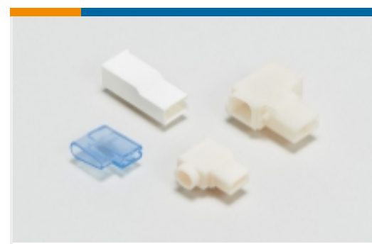
Crimp Terminal Housings(202)