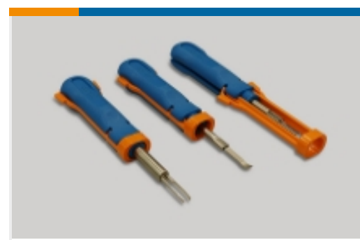
Insertion &amp; Extraction Tools(3)