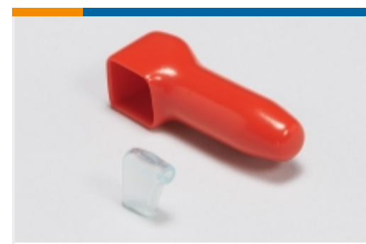
Insulation Boots &amp; Sleeves(4)